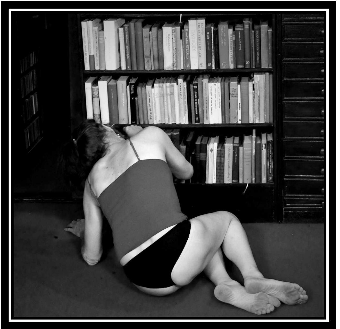
The library (2016).